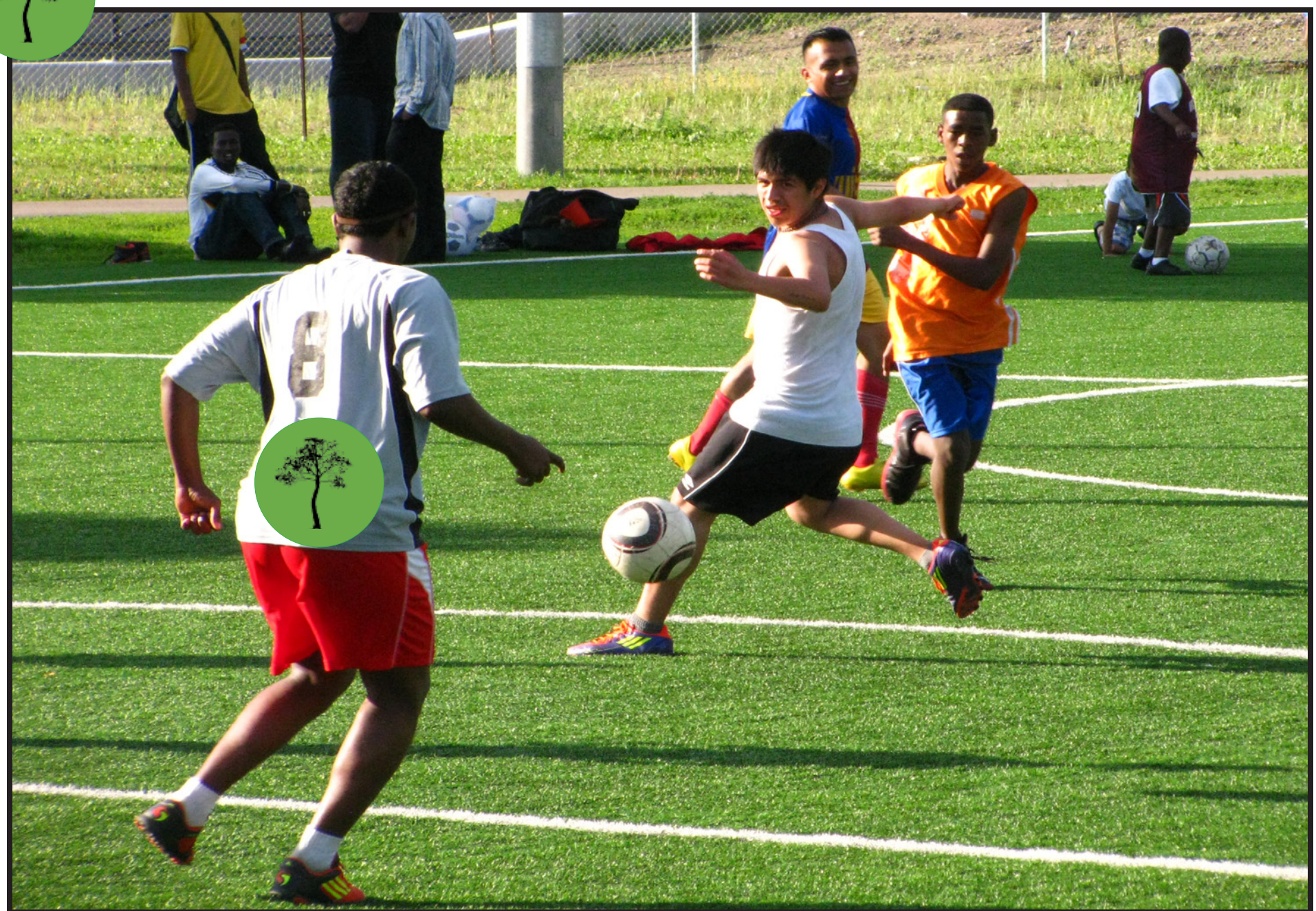
Build high quality soccer fields to address strong demand