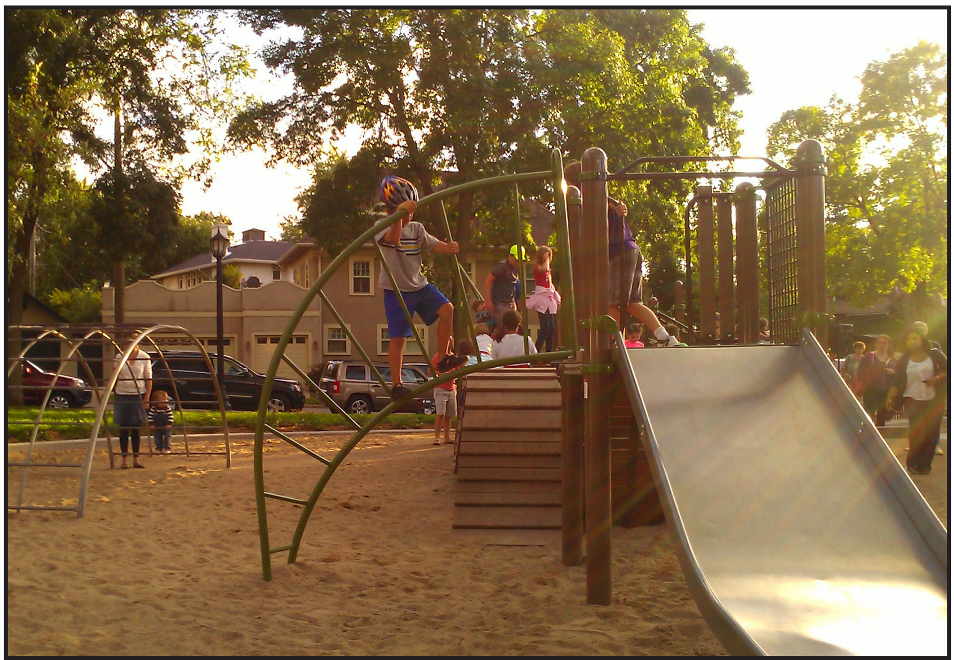
Work to provide parks that are walkable from all neighborhoods in Perry