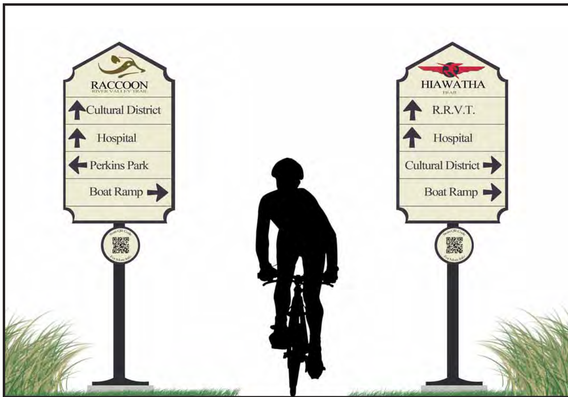
Incorporate wayfinding into the trails system