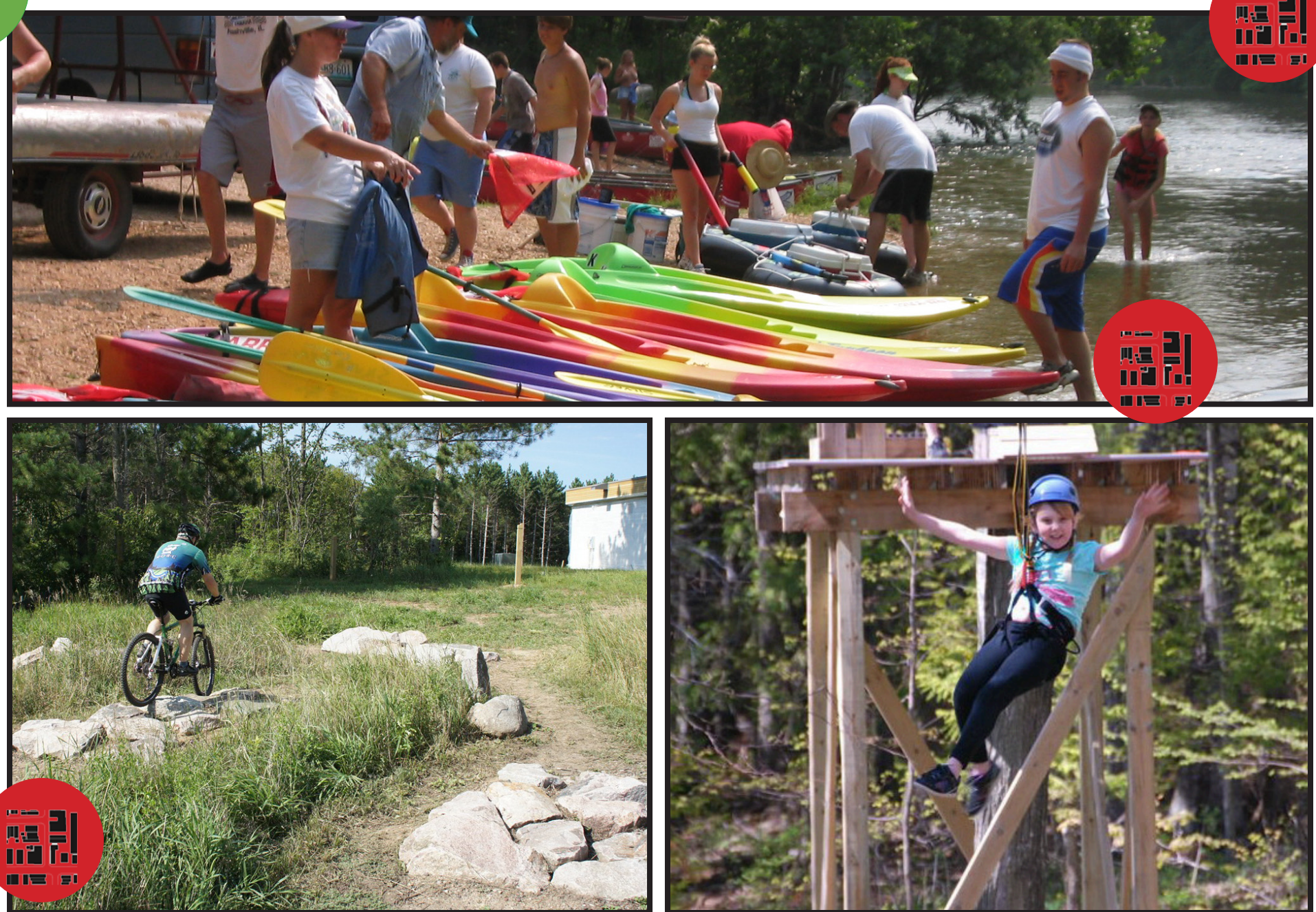
Action sports and activities would help Perry's identity as a destination for outdoor enthusiasts